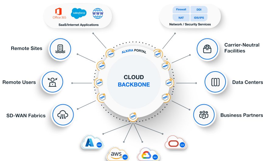
Figure: The Alkira Platform